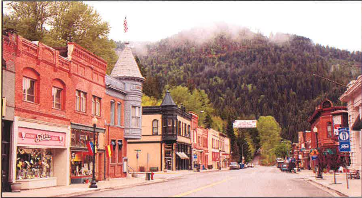
Bank Street in downtown Wallace.

"The whole town piggybacks with Lookout Pass as the outfitter for the Hiawatha," says Shaffer, and Lookout's Hiawatha website includes links to lodging and amenities in Wallace and other communities.