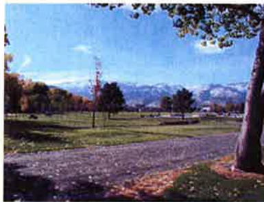
Mills Parks is Carson City's most heavily used community park.

The high level of use of Mills Park is a strong indication of the need for another Community park. This is reinforced by the public opinion survey, where 45% of survey respondents indicated it was important or very important for the City to add more Community parks to the City. An additional one or two Community parks in Carson City would help to alleviate the pressure that is currently being placed on Mills Park.