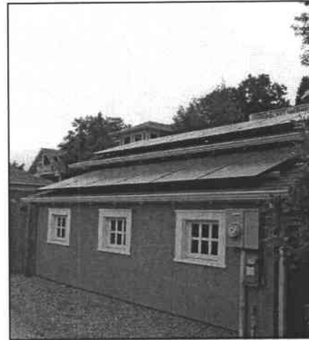
Solar panels placed on an accessory structure not visible from the public right of way should still follow the slope of the roof and have a low profile.