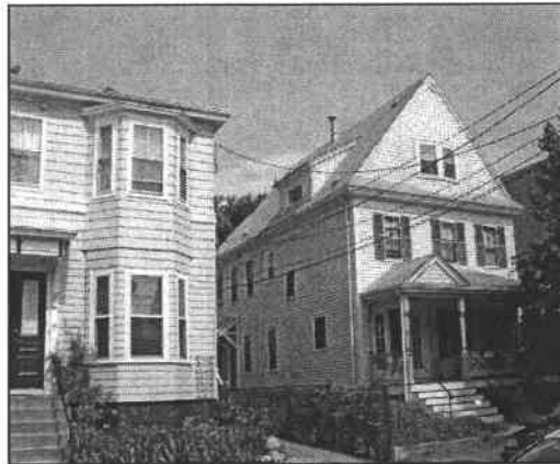
These solar panels low profile and location make them unobtrusive even though they are visible from the public right of way.