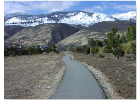
In the Public Opinion Survey, off-street walking/bike paths were rated as the single most important issue for the City to improve.

When asked in Question 10 about levels of park usage, and reasons for their level of use, the majority of residents indicated they “just don't use parks much.” Other, smaller numbers reported lack of play equipment and restrooms as reasons. However, in the “other category” there were a significant number of write-in comments indicating that their primary reason for not using City parks more frequently was because dogs were not permitted. In a separate question(#9), 53% of respondents indicated they owned dogs, and only 4% exercised them in parks. Many of the residents who were surveyed indicated a desire to have Carson City's parks allow dogs.