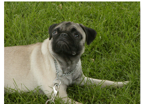
“Write in” comments from the Public Opinion Survey suggest that one deterrent to more usage of parks is because dogs are not permitted in many parks.