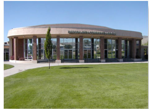
The public opinion survey indicated that a surprisingly high number of households are involved in cultural arts events such as those held at the Bob Boldrick Theater at the Community Center.