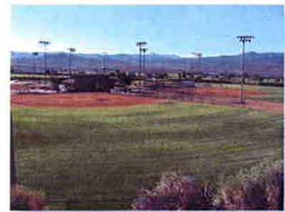
The sports fields at JohnD Winters Centennial Park.

The excellent condition maintained on the City's fields is an attraction to the growing tournament play the City has conducted over the past several years (see Section 5.4 The Economic Benefit of Tournaments). Also, Hispanic soccer teams use the JohnD Winters Centennial Park's lower complex soccer fields, and Mills Park for their championship games.