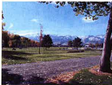
Mills Parks is Carson City's most heavily used community park.

The high level of use of Mills Park is a strong indication of the need for another Community park. This is reinforced by the public opinion survey, where 45% of survey respondents indicated it was important or very important for the City to add more Community parks to the City. An additional one or two Community parks in Carson City would help to alleviate the pressure that is currently being placed on Mills Park.