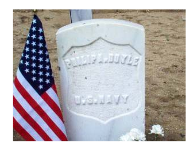
See Death Notice – Next Page