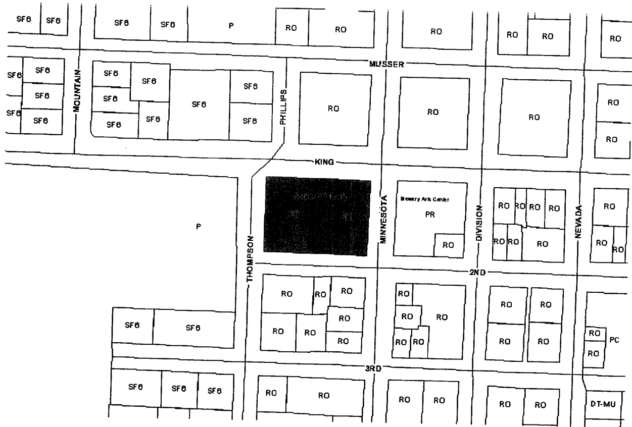
Proposed Zoning of Subject Parcels