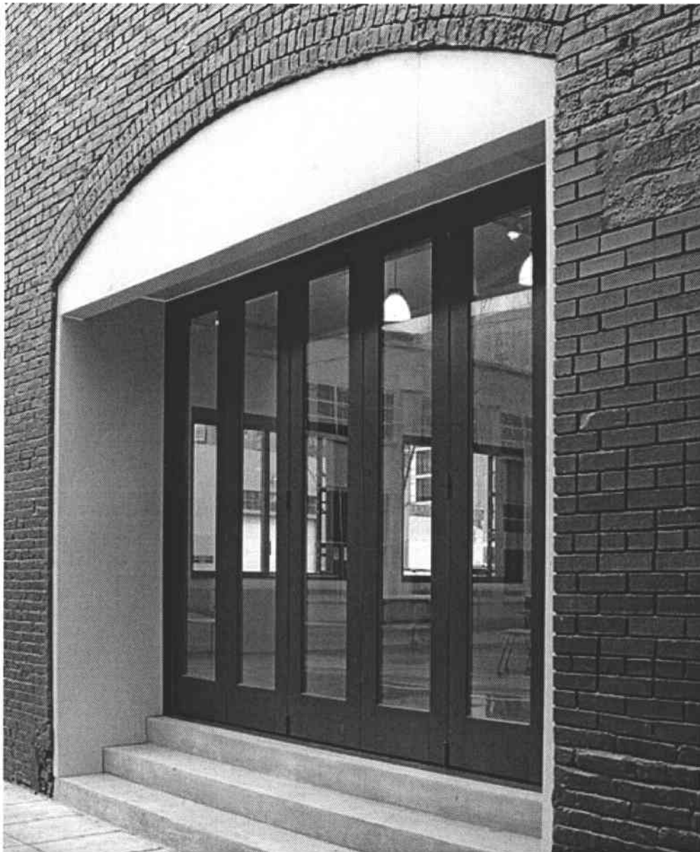
A six-panel folding door opens the building to the surrounding neighborhood and also contributes to the space's ventilation plan.