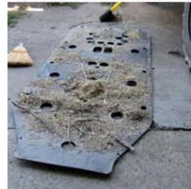
Skid plate from underneath an offroad vehicle

From Oregon Department of Agriculture Plant Program Noxious Weed Control