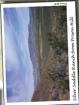
Silver Saddle Ranch from Prison Hill