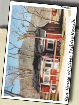
Red House at Silver Saddle Ranch