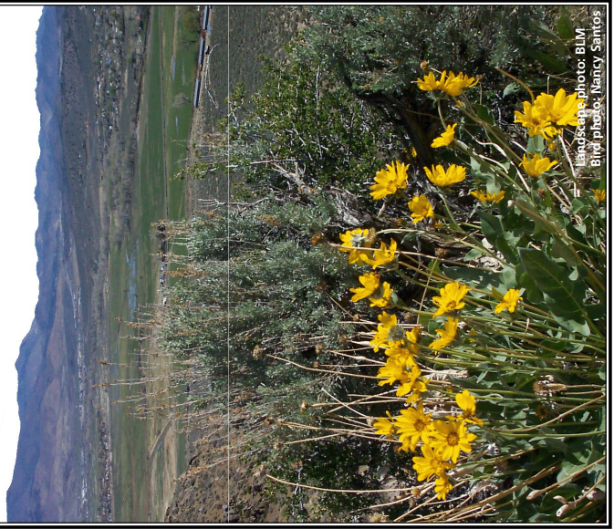
Landscape photo: BLM Bird photo: Nancy Santos