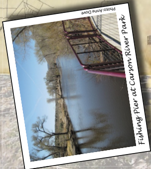
Fishing Pier at Carson River Park