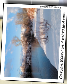
Carson River in Ambrose Area