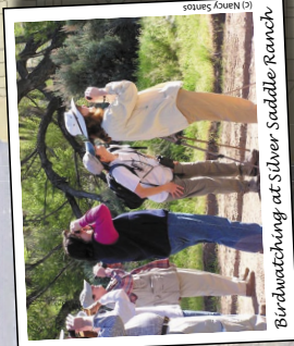
Birdwatching at Silver Saddle Ranch