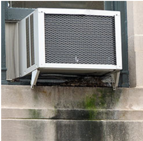
Figure 13. Window air conditioning units can cause damage to surfaces below when condensation drips in an uncontrolled manner. Drip extension tubes can sometimes be added to direct the discharge.