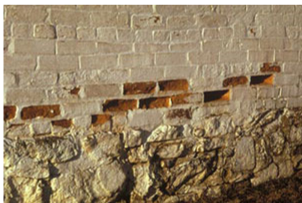
Figure 10. Repointing of masonry should usually be approached as repair rather than maintenance work in part because of the need for a skilled mason familiar with historic mortar. In this case, a moisture condition was not corrected and the use of a waterproof coating and off-the-shelf Portland cement mortar trapped water and resulted in further damage to these 19th century bricks.