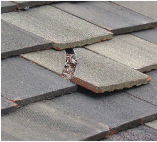
Figure 4. Damage to roofs often requires immediate attention. As a temporary measure, this damaged roof tile could be replaced with a brown aluminum sheet wedged between the existing tiles.

out trapped leaves and debris from around equipment base and consider adding a protective walkway for access.