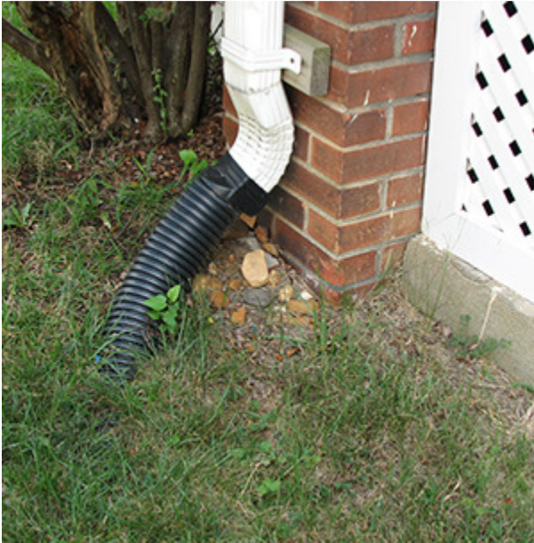
Figure 17. Extending downspouts at their base is one of the basic steps to reduce dampness in basements, crawl spaces and around foundations. Extensions should be buried, if possible, for aesthetics, ease of lawn care, and to avoid creating a tripping hazard.