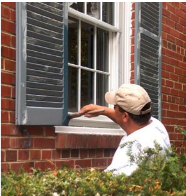
Figure 12. Good surface preparation is essential for long lasting paint. Scraping loose paint, filling nail holes and cracks, sanding, and wiping with a damp cloth prior to repainting are all important steps whether touching up small areas or repainting an entire feature. Always use a manufacturer's best quality paint. Windows and shutters may need repainting every five to seven years, depending on exposure and climate.