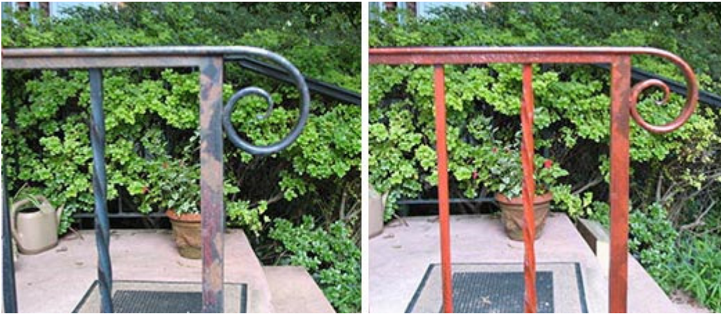
Figure 15. Metal projecting elements on a building, such as sign armatures and railings, are easily subject to rust and decay. Proper surface preparation to remove rust is essential. Special metal primers and topcoats should be use