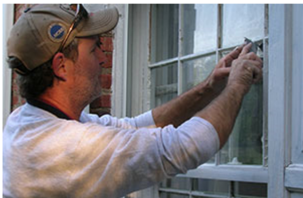
Figure 11. Glazing putty should be maintained in sound condition to prevent unwanted air infiltration and water damage. New glazing putty should be pulled tight to the glass and edge of the wood, creating a clean bevel that matches the historic glazing