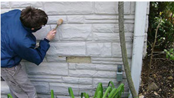
Figure 6. Stucco applied to an exterior wall or foundation was intended to function as a watertight surface. Unless maintained, rainwater will penetrate open joints and cracks that may occur over time. A spa lied section of stucco indicates some damage has occurred and a wooden mallet is being used to tap the surface to determine whether the immediate stucco has lost adhesion.