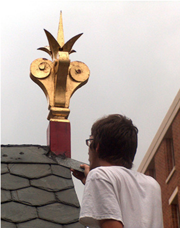
Figure 5. The use of a sealant to close an exposed joint is not always an effective long-term solution. Where this decorative wood element connects to the slate roof, the sealant has failed within a short time and a proper metal flashing collar is being fitted instead.

masonry. Spalled masonry is often evidence of the previous use of a mortar mix that was too hard.