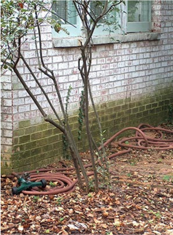
Figure 16. This chronically wet area has a mildew bloom brought on by heat generated from the air-conditioning condenser unit. The dampness could be caused by a clogged roof gutter, improper grading, or a leaking hose bibb.