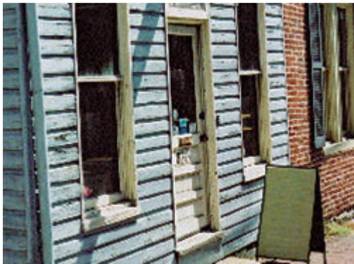
Figure 8. The paint on the siding of this south-facing wall needs to be scraped, sanded, primed and repainted. Postponing such work will lead to further paint failure, require greater preparatory costs, and could even result in the need to replace some siding.