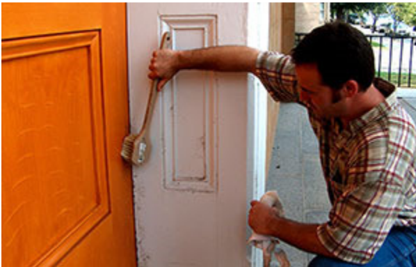
Figure 9. To help extend a repainting cycle, dirt and spider webs should be removed before permanent staining occurs. In this case, a natural bristle brush and a soft damp cloth are being used to remove insect debris and refresh the surface appearance.