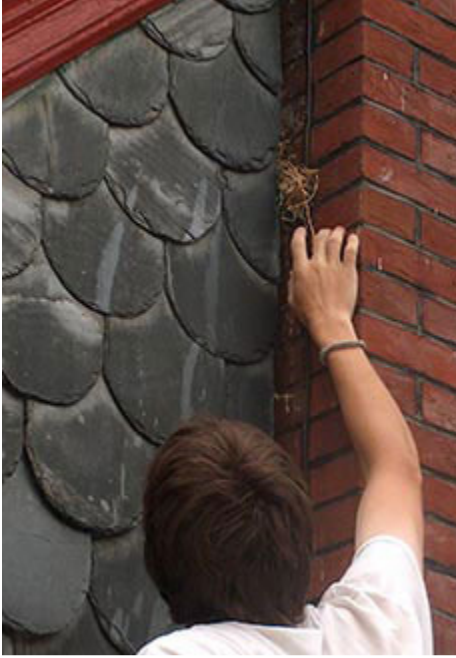
Figure 14. When inspecting connections between projections and the main building, look for areas where birds, bees and pests may enter or nest. Birds have been nesting in this porch roof and the area is being cleaned of their debris. Where an opening exists, it may be necessary to cover it with a trim piece, screening, or sealant.

Numerous projections may exist on a historic building, such as porches, dormers, skylights, balconies, fire escapes, and breezeways. They are often composed of several different materials and may include an independent roof. Principal maintenance objectives include directing moisture off these features and keeping weathered surfaces in good condition. Secondary projections may include brackets, lamps, hanging signs, and similar items that tend to be exposed to the elements.