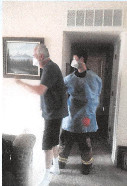
Patient exiting residence in preparation for transport to the hospital