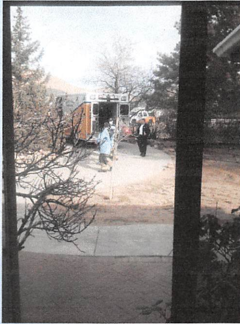
Paramedic preparing to enter residence and assess the patient