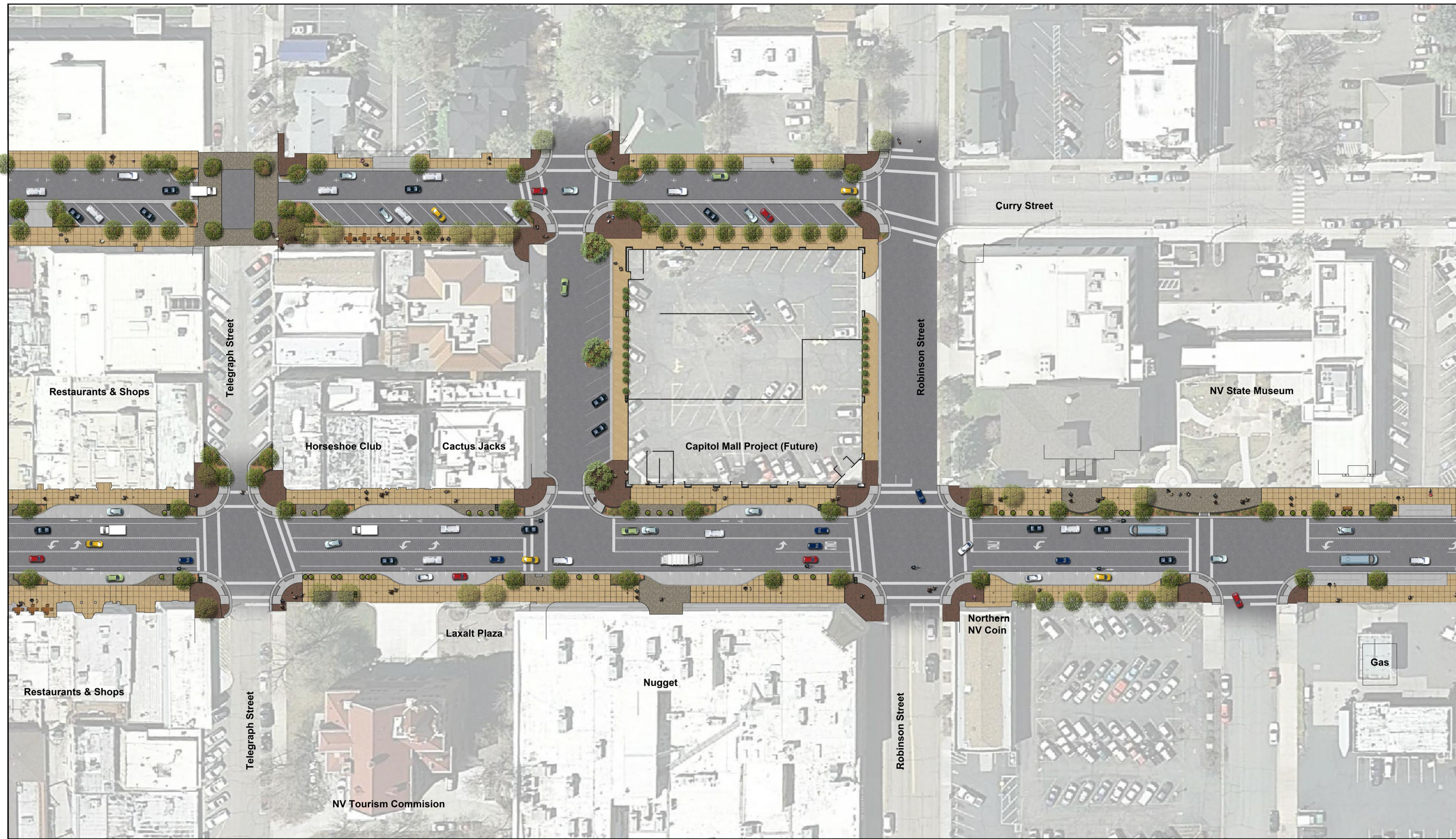
Carson City Downtown Streetscape Carson City, NV