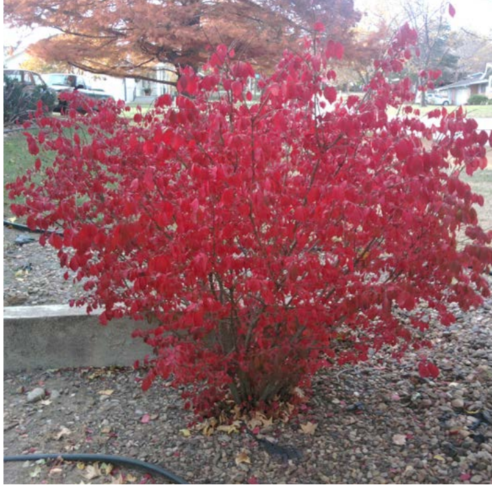
Euonymus alatus Burning Bush

Dense, twiggy, flat topped deciduous shrub.