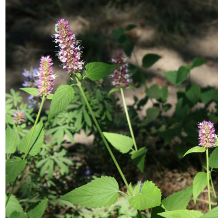
Agastache urticifolia Nettleleaf Giant Hyssop

A hardy cluster of stems growing 3 to 6 feet tall.