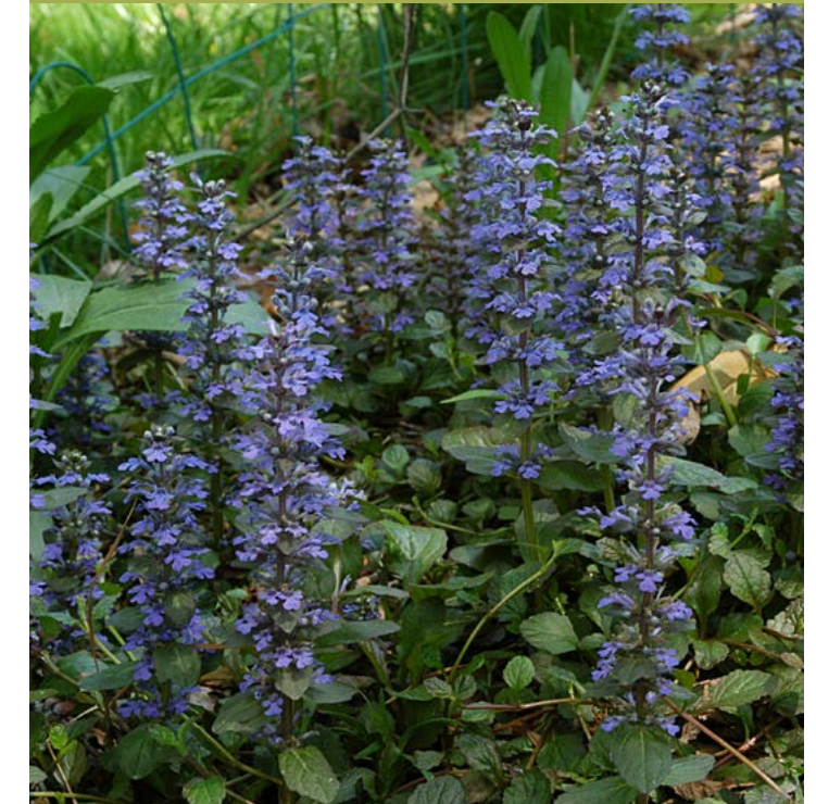
Ajuga reptans Blue Bugle

Quickly spreading perennial ground cover.