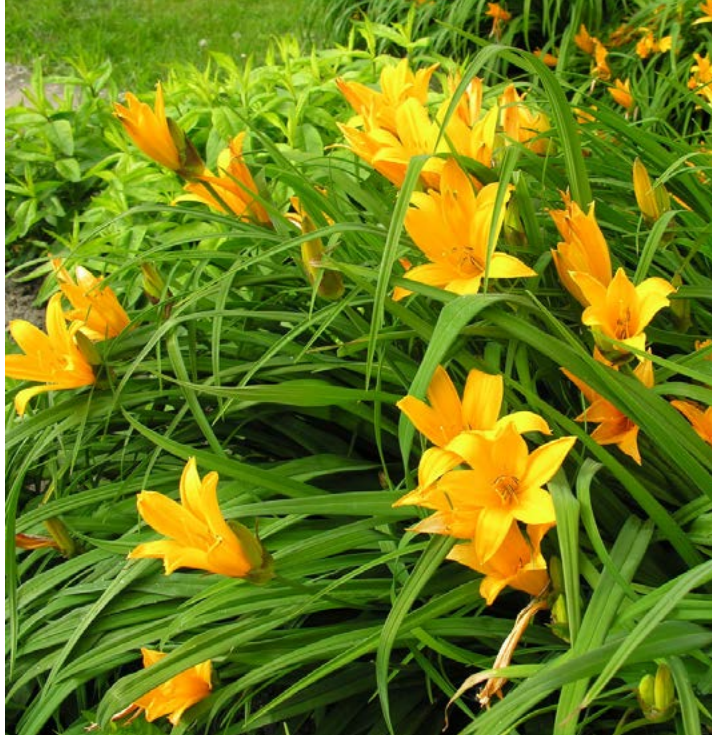
Hemerocallis spp. Daylily