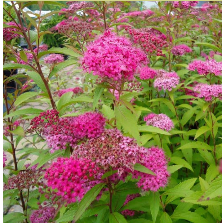
Spirea bumalda 'Anthony Waterer' Anthony Waterer Spirea