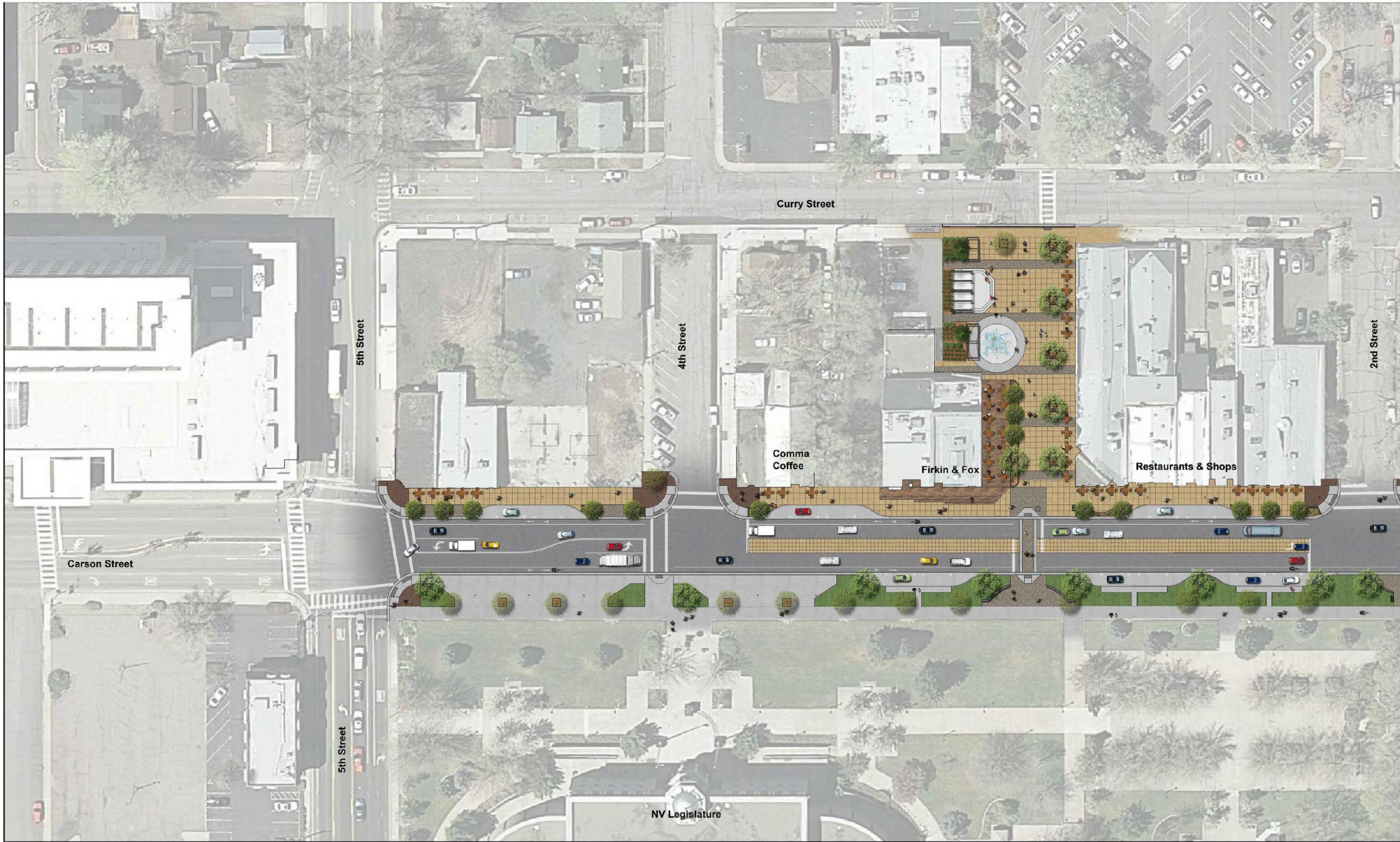
Carson City Downtown Streetscape Carson City, NV