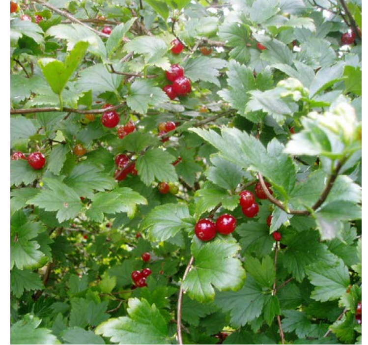
Ribes alpinum Alpine Currant

Compact, mound-forming deciduous shrub used for hedging.