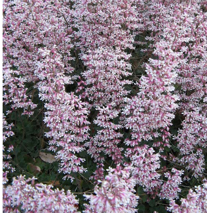
Heuchera spp. Coral Bells

Compact evergreen clumps of roundish leaves.