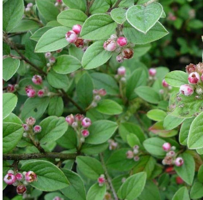
Cotoneaster lucidus Hedge Cotoneaster

Vigorous deciduous shrub, reaching a mature height of 6-10 feet