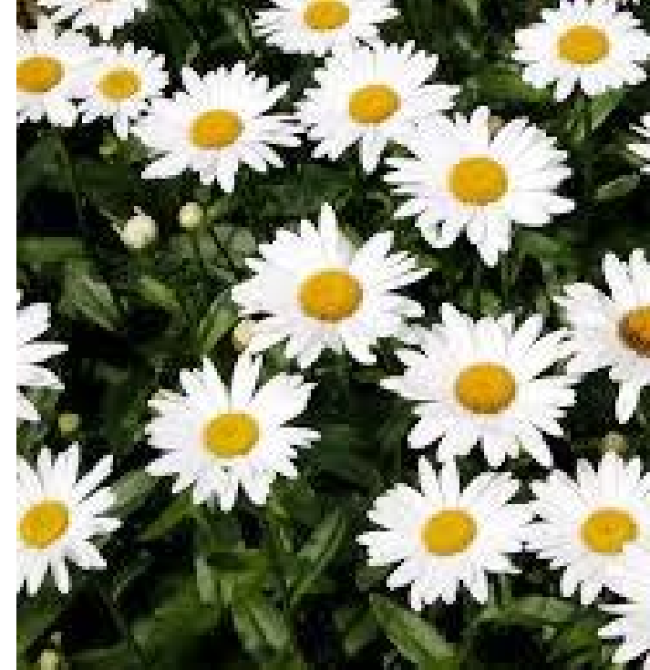
Leucanthemum superbum Shasta Daisy

Herbaceous flowering plant growing 3-4 feet high and 2-3 feet wide.