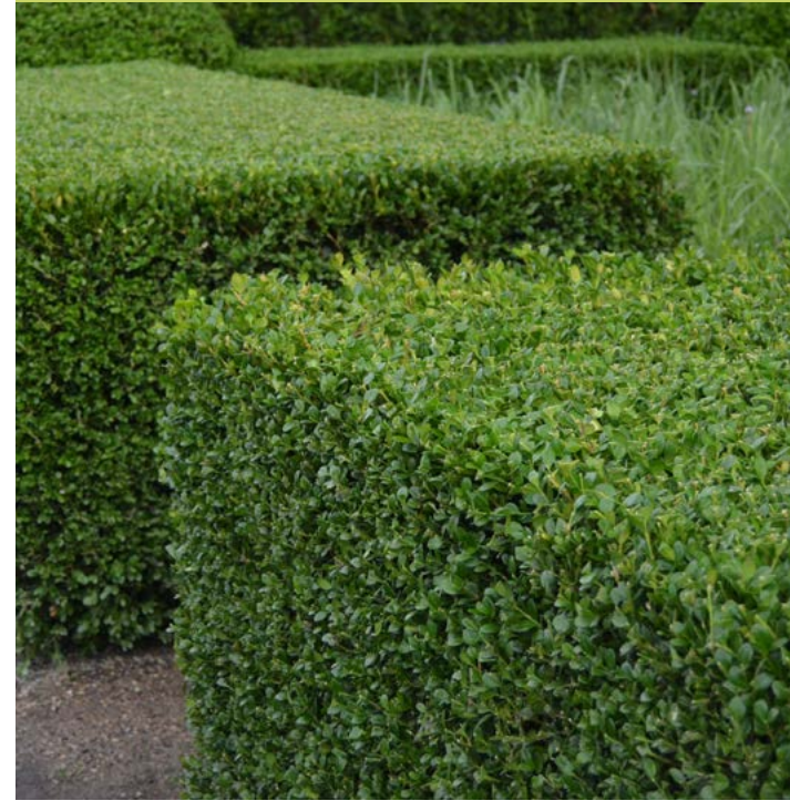
Buxus sempervirens Common Boxwood

Evergreen shrub used for edging and hedging. Dwarf varieties are most common.