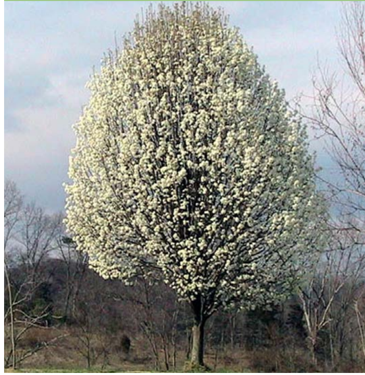
Pyrus calleryana Callery Pear