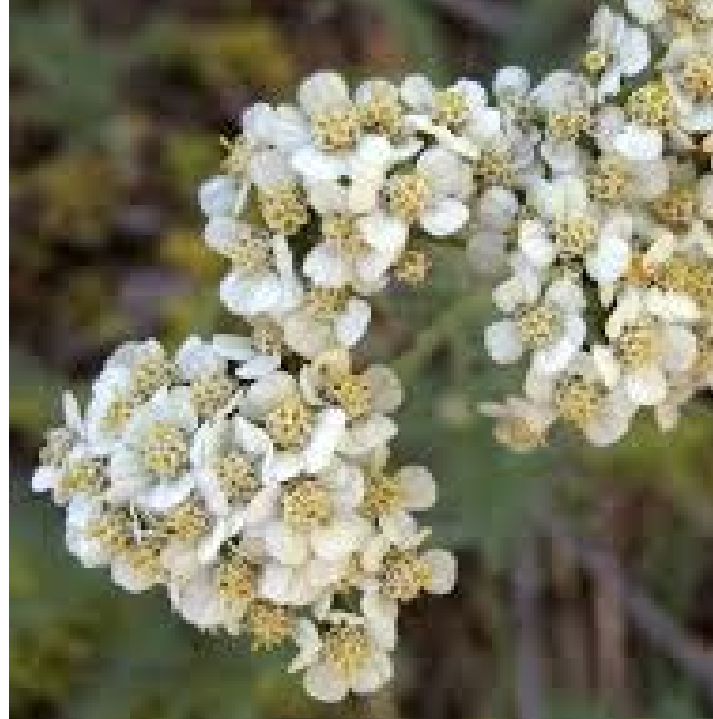
Achillea spp. Yarrow

Generously blooming perennials for summer and early fall.