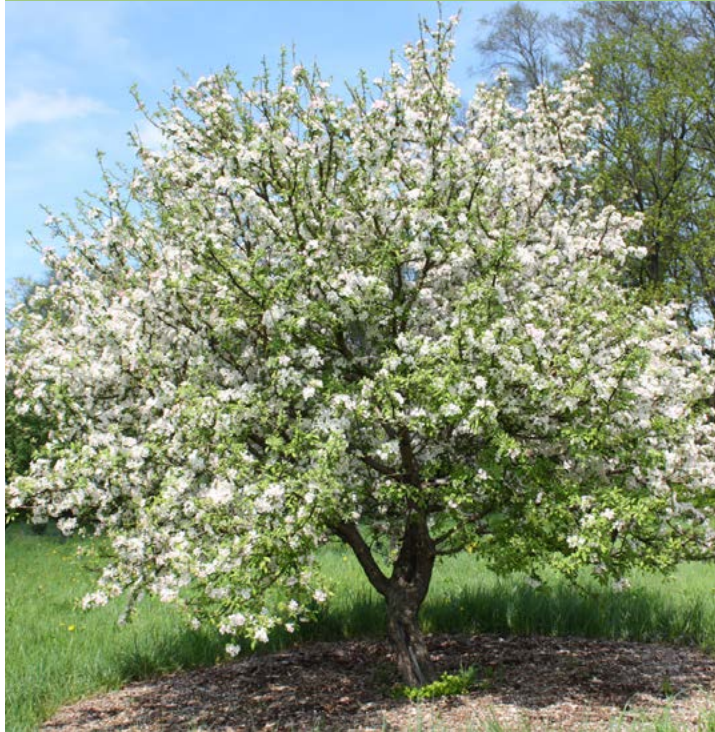
Malus spp. Crabapple

Grows to 20-25 feet. Some varieties can reach a mature height of 30 feet.