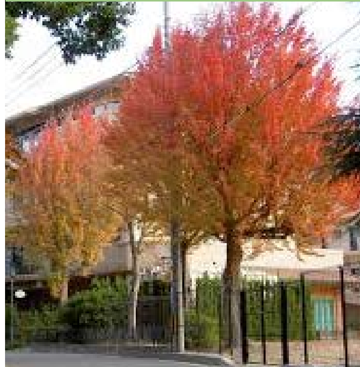
Acer buergerianum Trident Maple

Grows to 20-25 feet tall with a rounded crown and low spreading growth.