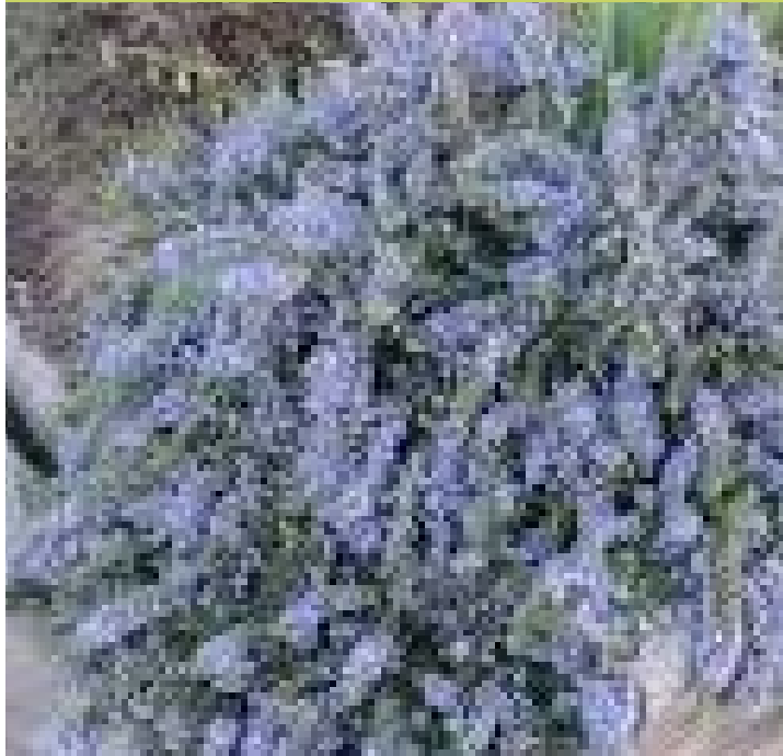
Rosmarinus officinalis 'Prostratus'