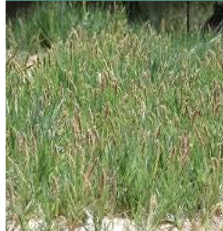
Sporobolus wrightii Giant Sacaton