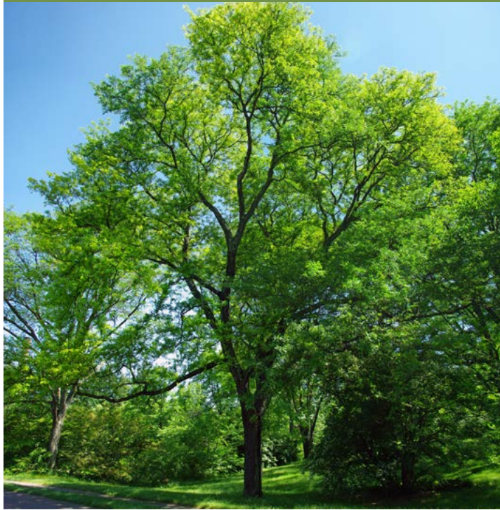
Gleditsia triacanthos inermis Thornless Honey Locust

Fast growing upright trunk and spreading arching branches. Reaches 35-70 feet.