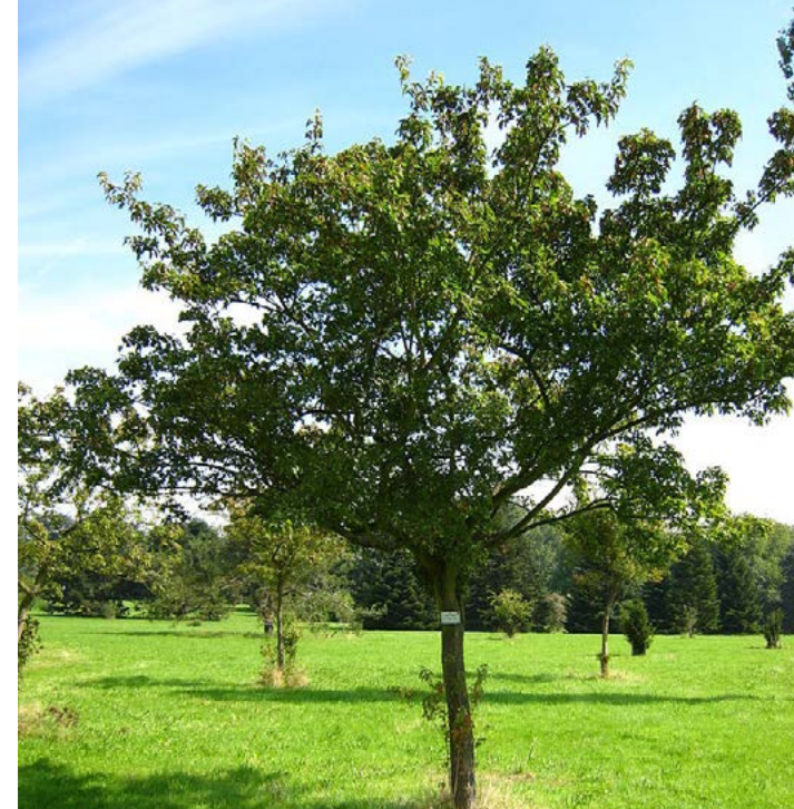
Acer ginnala Hornbeam