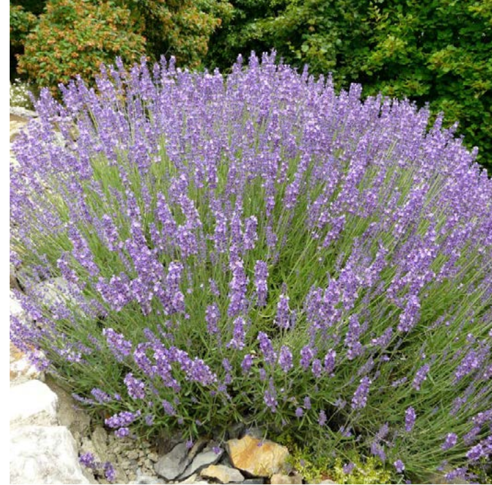
Lavandula spp. Lavender

Evergreen shrub with grayish/green aromatic foliage used for perfume.