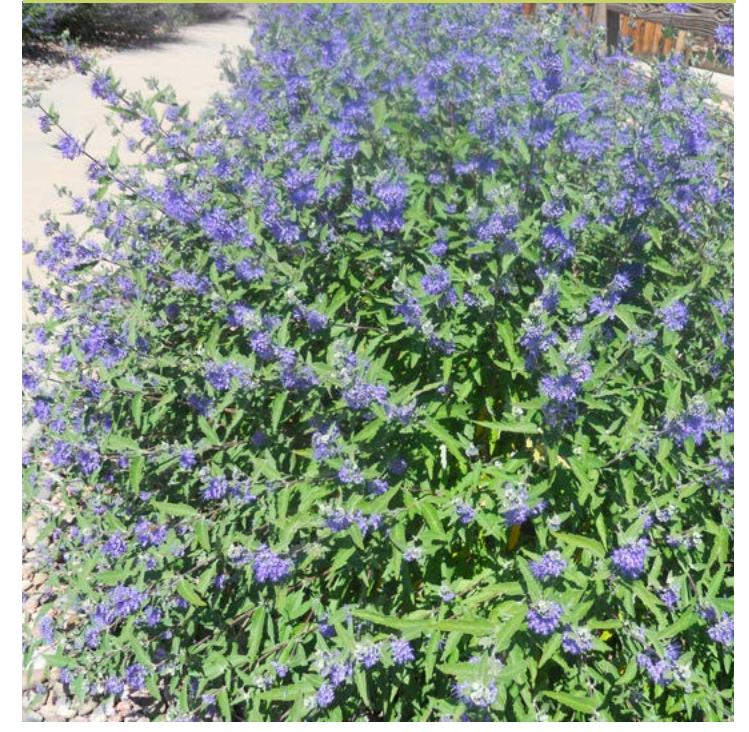
Caryopteris clandonensis Blue Mist Spirea