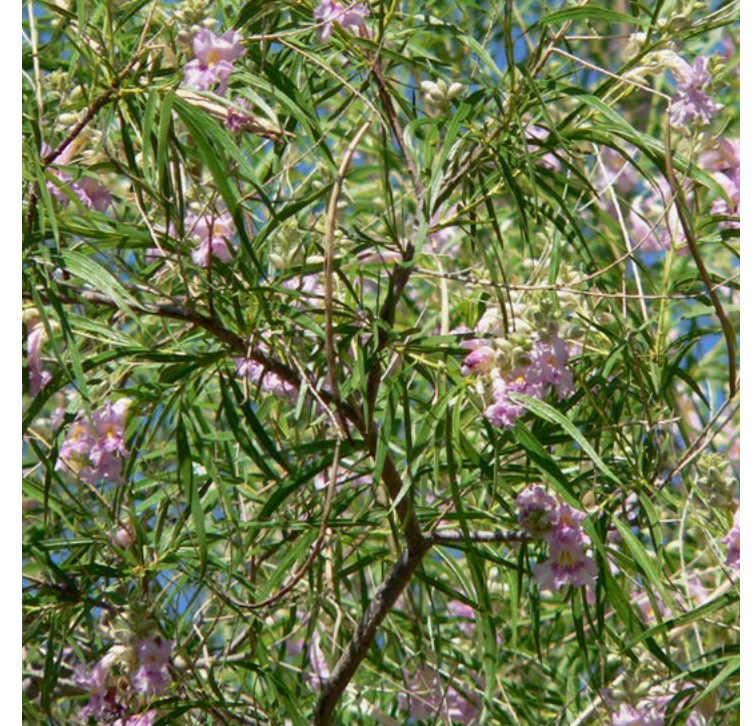
Chilopsis linearis Chitalpa

Grows fast, about 3 feet per season until it reaches mature height of 25 feet.