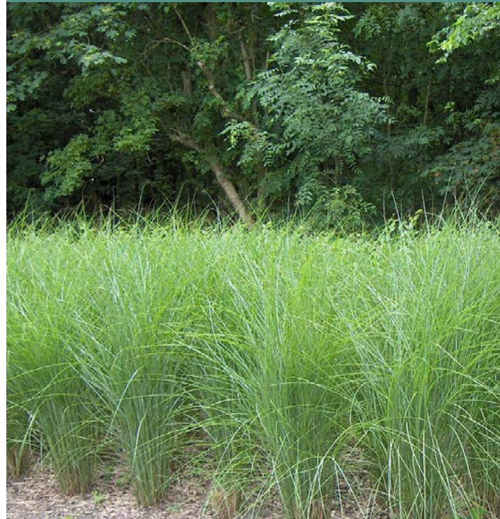
Miscanthus sinensis Maiden Grass