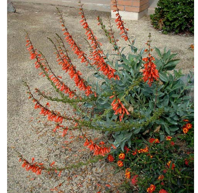
Penstemon eatonii Firecracker Penstemon

Evergreen perennial that grows to about 4 feet.