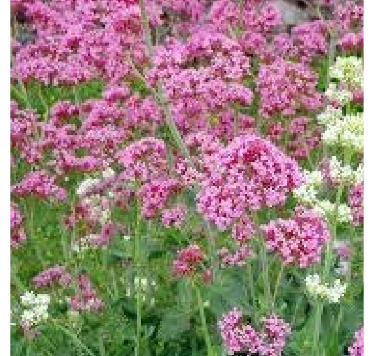
Centranthus ruber Jupiter's Beard

A bushy perennial, growing up to 3 feet in height.