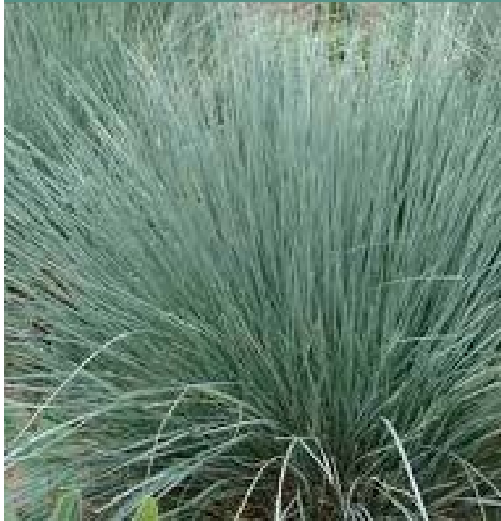
Helictotrichon spp. Blue Oat Grass

Perennial evergreen grass forming 2-3 foot clumps.