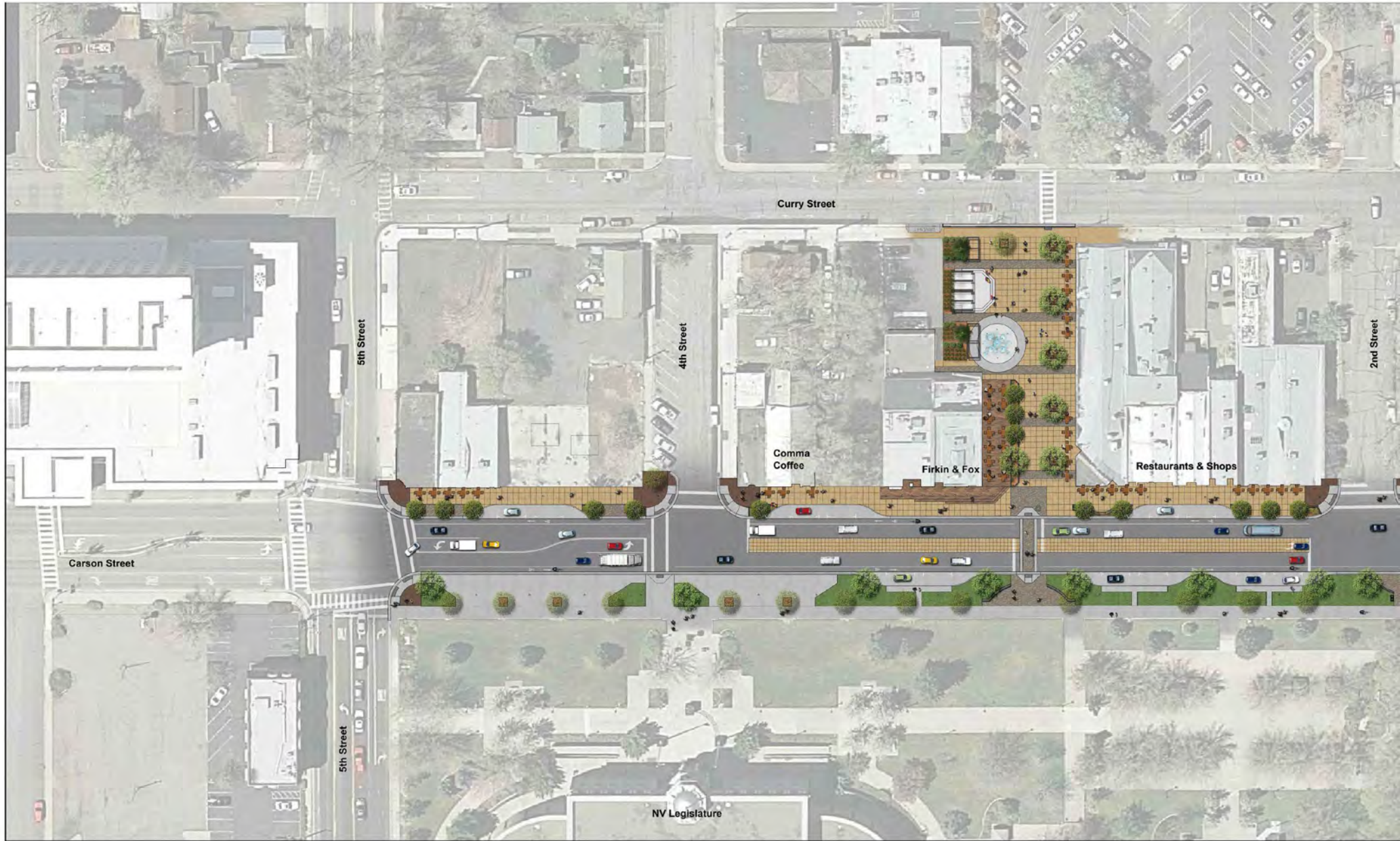
Carson City Downtown Streetscape Carson City, NV