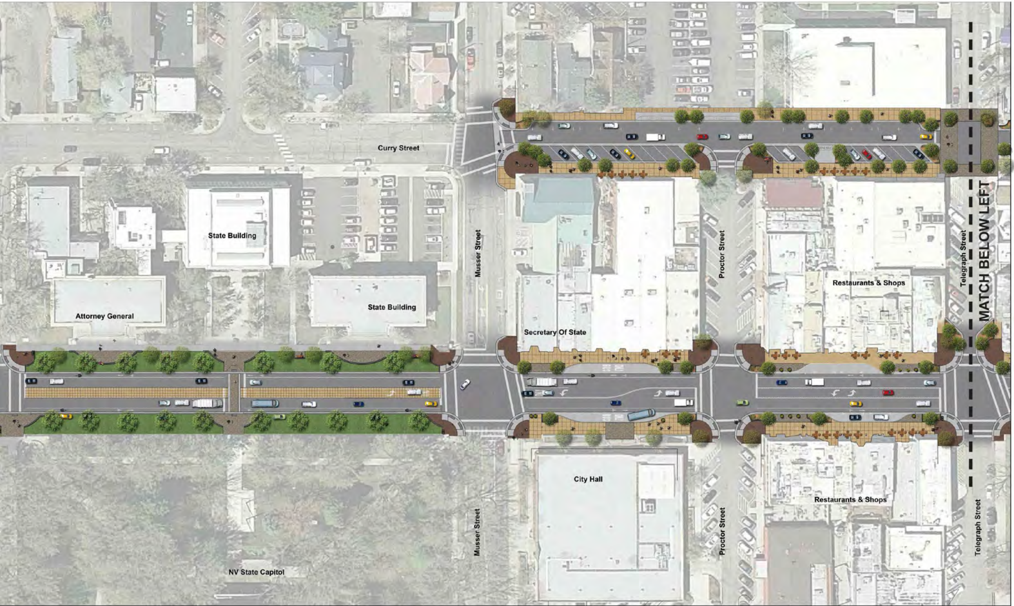
Exhibit B - Downtown Improvement Plan Sheet 2 of 4