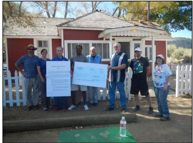
Celebrating the land conveyance – a symbolic exchange of the check for the land deed.