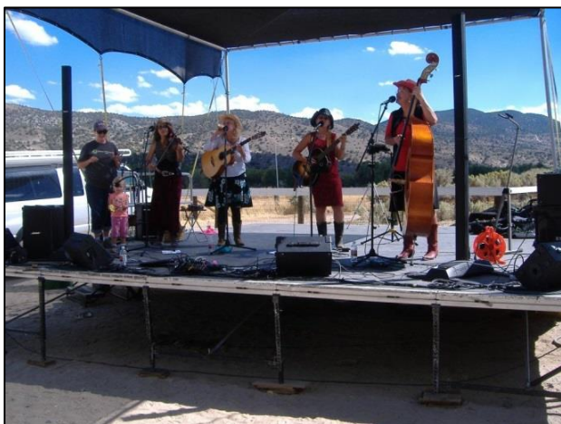
Sierra Sweethearts performs for the celebraion.