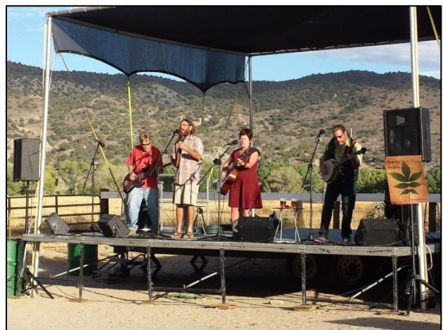
Hick’ry Switch performs for the celebration.