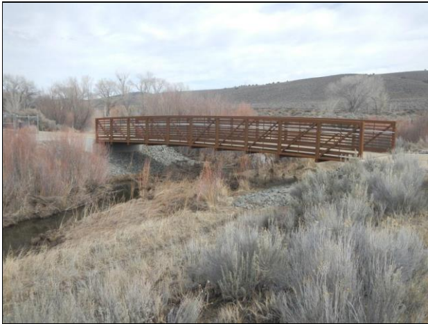
Eagle Valley Creek bridge

Eagle Valley Creek trail segment: The long-awaited bridge crossing the Eagle Valley Creek was installed in December. The bridge provides a dry crossing from the Empire Ranch Trail on the north to open space and Riverview Park to the south. The bridge and adjacent trail improvements were made possible by a grant from the Southern Nevada Public Land Management Act.