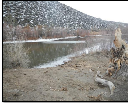
Carson River – after channel clearing

Eagle Creek / Empire Ranch Trail Bank Stabilization: Staff received $12,400 from the CWSD to conduct stabilization and minor repair of the Empire Ranch Trail. In 2014, following heavy rains, the creek banks along the Empire Ranch Trail were impacted by high water flows, resulting in significant erosion and partial loss of the trail. These funds allowed staff to hire a contractor to perform the repair of the bank failure. Staff assisted the Carson City Parks Division with a grant, permits and hiring a contractor to complete the repair.