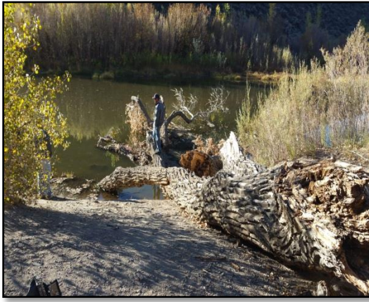
Carson River – before channel clearing