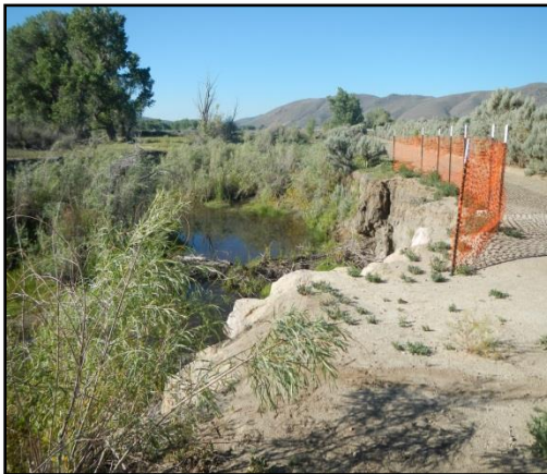
Empire Ranch Trail – before stabilization

Eagle Creek / Empire Ranch Trail Bank Stabilization: Staff received $12,400 from the CWSD to conduct stabilization and minor repair of the Empire Ranch Trail. In 2014, following heavy rains, the creek banks along the Empire Ranch Trail were impacted by high water flows, resulting in significant erosion and partial loss of the trail. These funds allowed staff to hire a contractor to perform the repair of the bank failure. Staff assisted the Carson City Parks Division with a grant, permits and hiring a contractor to complete the repair.