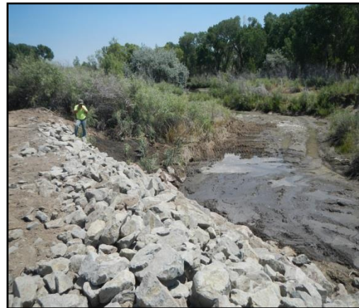
Empire Ranch Trail – after stabilization

Fuels Management: Fuels management on acquired lands, as well as natural parks and the wildland-urban interface, is a top priority for the Open Space Division. Our well-received fine fuels management program through the use of sheep continued. The 10 th consecutive year with targeted sheep grazing was conducted April – May, lasting 6 ½ weeks. Due to recent past and predicted drought conditions and the desire to maintain desirable species, just one band was used to graze herbaceous fuels on less than 2,000 acres. The Principles of Range Management class at the University of Nevada, Reno conducted a fieldtrip to Carson City to learn about land and grazing management.