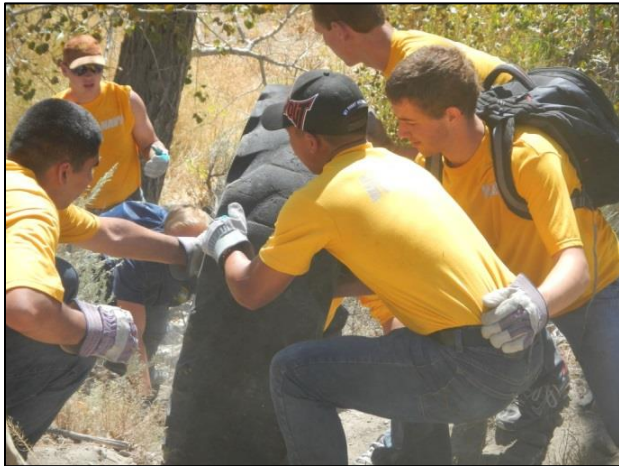
Carson High School ROTC helping with cleanup along the Carson River.