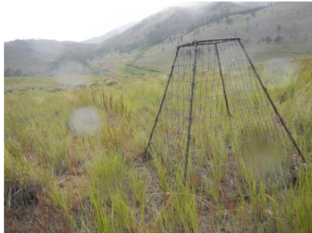
Post-grazing late May 6, 2016