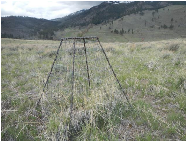
Pre-grazing April 25, 2016

Staff has been monitoring our fuels reduction project in the wildland urban interface on the west side of Carson City. The sheep were delivered behind Greenhouse Garden Center on April 7 th . They focused on the lower portions of our interface, adjacent to all of the residential areas. The contractor (Borda Land and Sheep) delivered 750 sheep and 1,100 lambs on the west side, and they grazed targeted areas for approximately 6 weeks. Staff monitors specific locations prior to grazing, post grazing and at the end of the growing season. While monitoring each site, staff looks for impacts on the cheatgrass, desirable vegetation, and soils. Two of the monitoring tools used for this project include stubble height and landscape appearance measurements. These monitoring techniques help determine utilization of plants by the sheep during the project. Pre-grazing monitoring occurred from April 3 rd - June 2 nd . Post grazing monitoring occurred from April 19 th - June 2 nd . The end of the growing season monitoring will occur in September. Staff noted that the areas grazed appeared to have minimal utilization during the project. The abundant spring rains resulted in new germination and further growth of the plants. The sheep are just one tool to help reduce the fire risk to our community. Residents are encouraged to utilize precaution measures around their home as well.