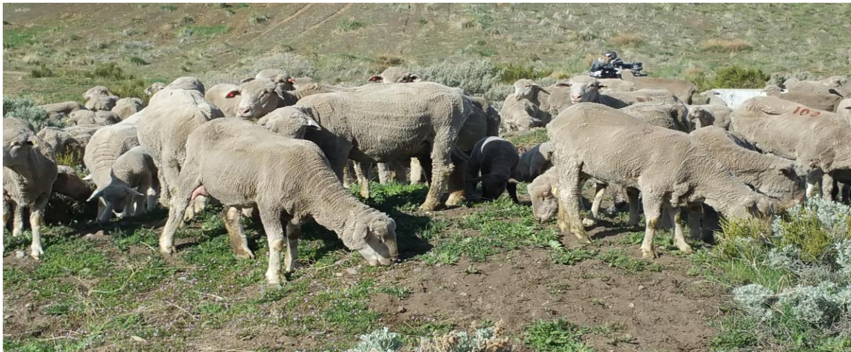
Approximately 1850 sheep released on April 7, 2016 behind Greenhouse Garden Center