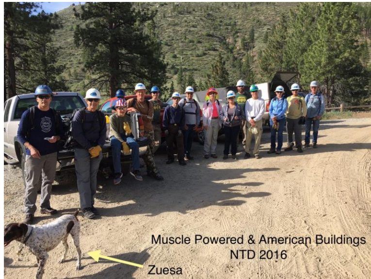
National Trails Day

On Saturday, June 4 th , 15 volunteers participated in trail maintenance on the Ash Creek Trail. The planning efforts and crew leaders were led by Muscle Powered and many volunteers are also Muscle Powered members. Four volunteers joined us from American Buildings, and coffee and pastries were donated by Starbucks. The Ash Creek Trail was identification for maintenance in preparation of the Epic Rides mountain bike event on June 17-19.