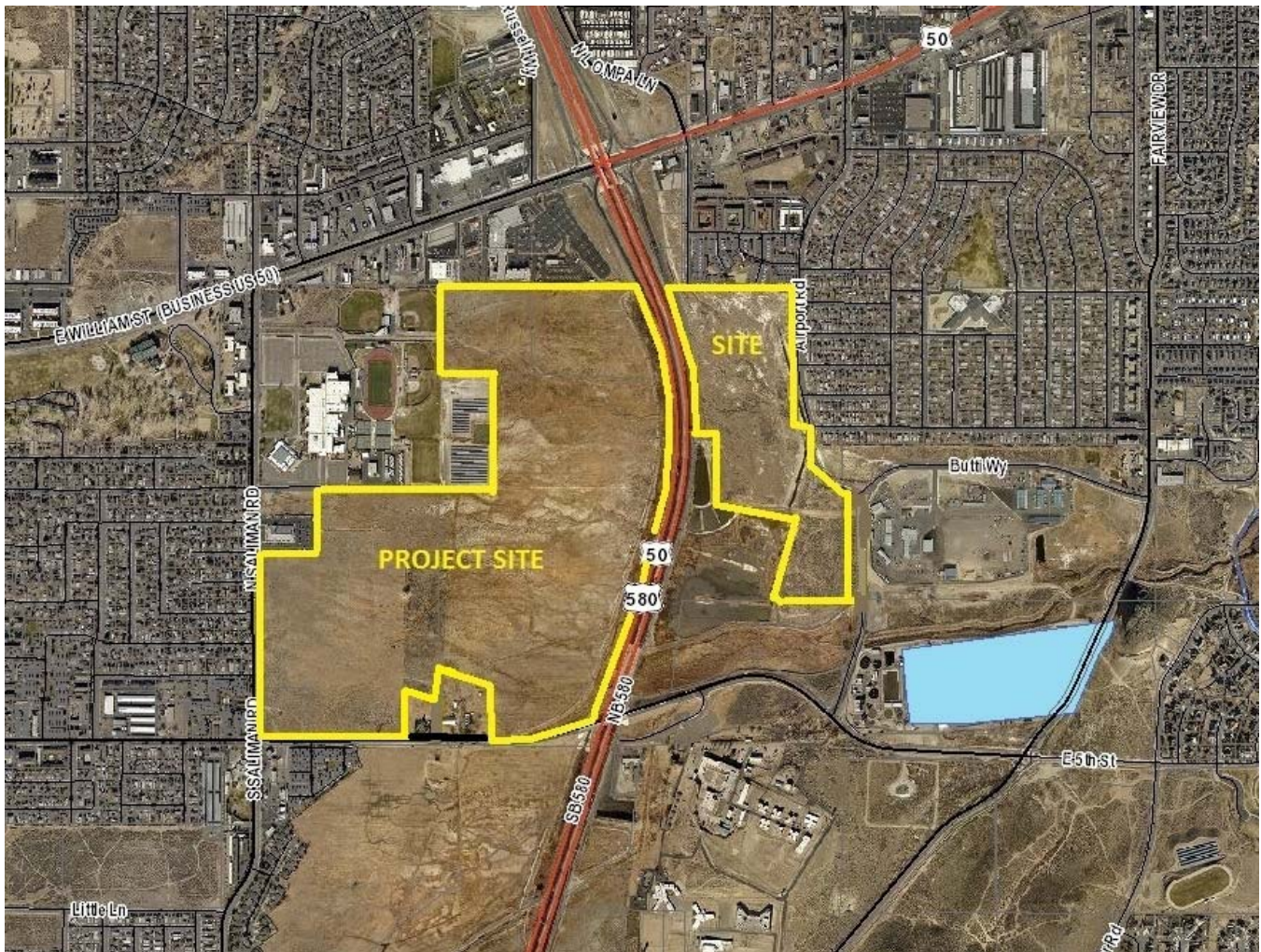
Figure 1 – Lompa Ranch North Specific Plan Area

The Lompa Ranch North Specific Plan Area encompasses 251.31± acres. The majority of land (203.27±) acres is located on the west side of Interstate 580, north of East Fifth Street, east of Saliman Road, and south of US Highway 50 (East William Street). The remaining 48.04± acres is located on the east side of Interstate 580 along the western side of Airport Road. Figure 1 (below) depicts the Lompa Ranch North in context with the surrounding area.