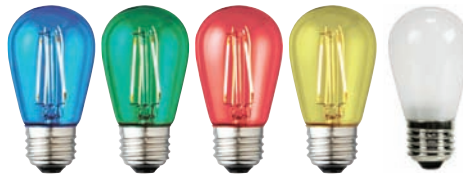
S14F VARIOUS COLORS CONSULT FACTORY (SPECIAL ORDER) (SUBJECT TO AVAILABILITY)

CONSULT FACTORY SPECIAL ORDER (SUBJECT TO AVAILABILITY)