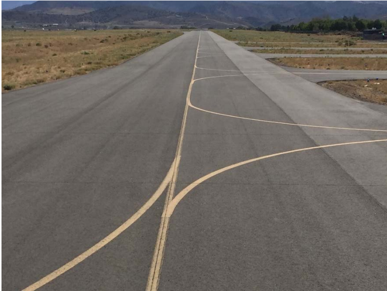
Taxiway A looking east