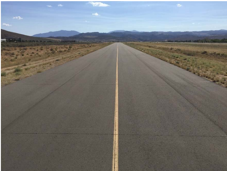
Taxiway D looking east