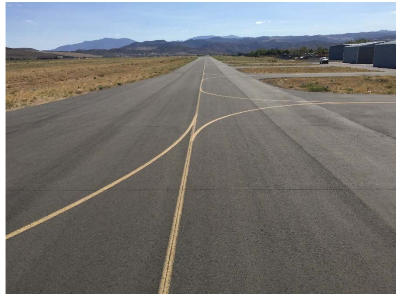
Taxiway D looking west