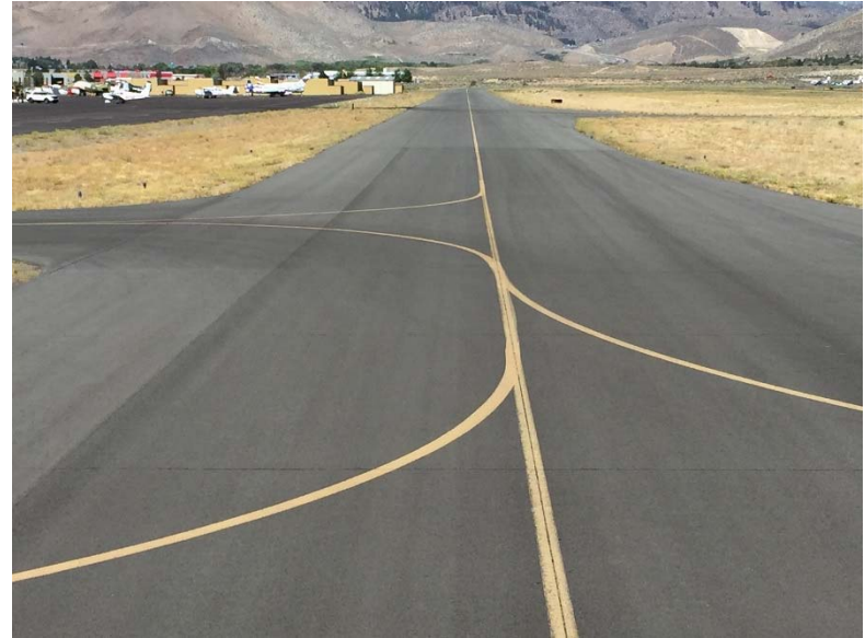
Taxiway A looking west