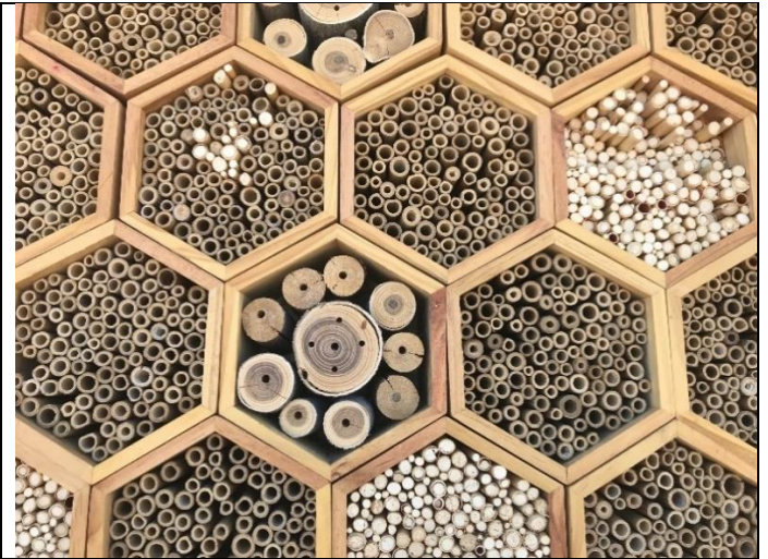
Foothill Pollinator Garden