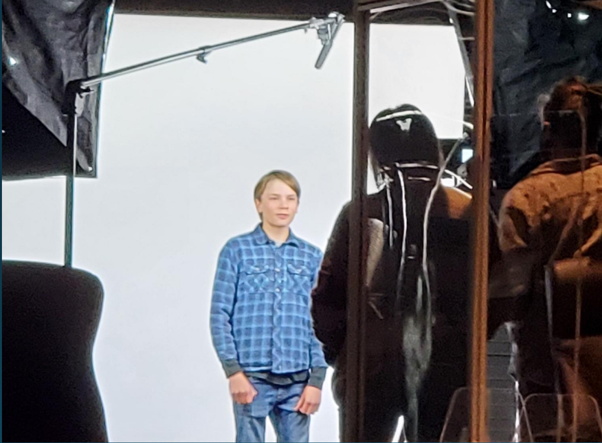
Filming "Water Connects Us All"

Join in Live Zoom Q & A at 11:30am, March 3, 2021 or listen to the recorded version appended to this Education and Outreach Session.