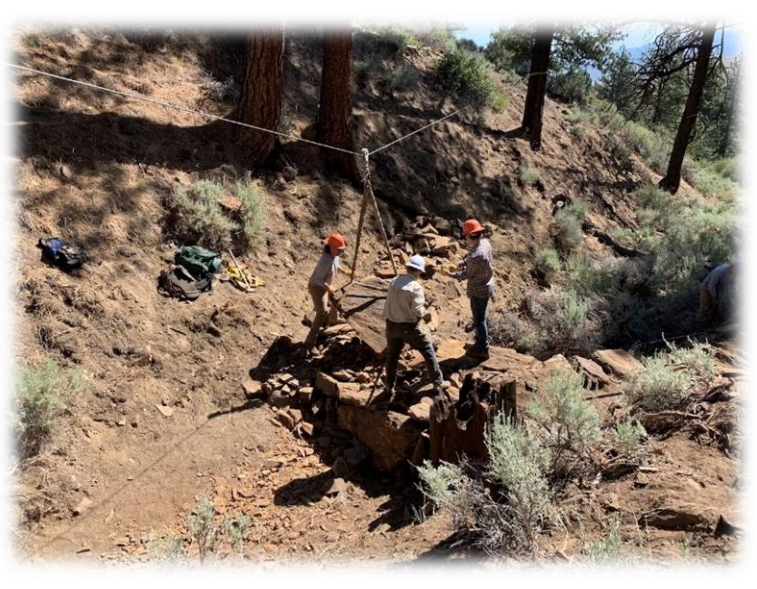
Volunteers moving boulders on Lincoln Bypass