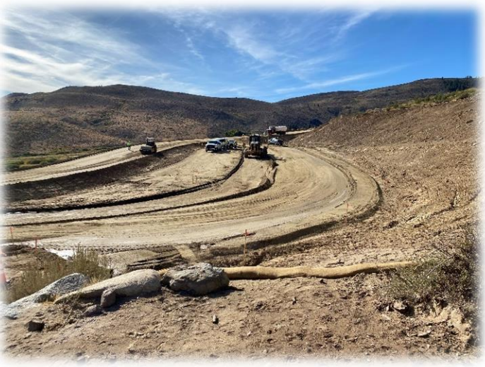
Same photo angle September 2021