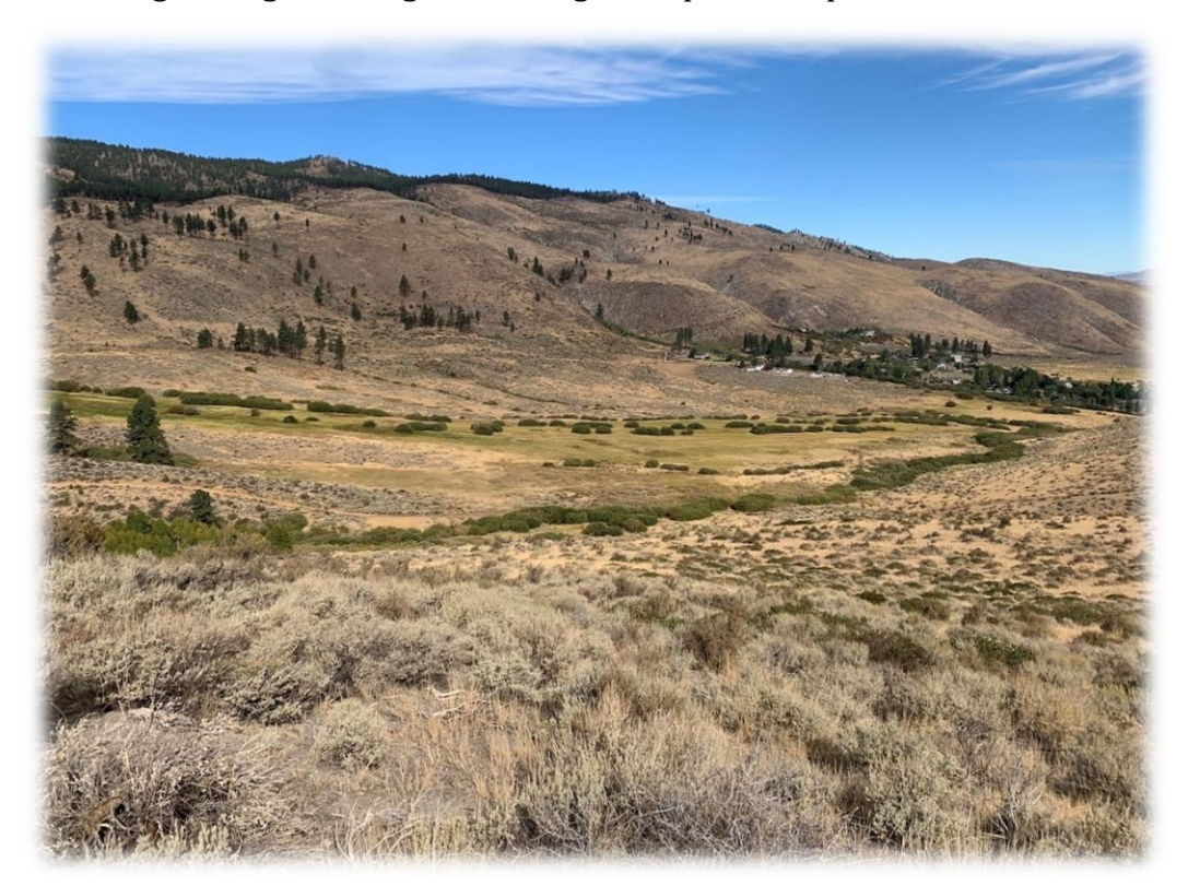
View of Borda Meadow from the Lincoln Bypass

Together, Lincoln Bypass and Capital to Tahoe will add over 13 miles of new trail to Carson City.