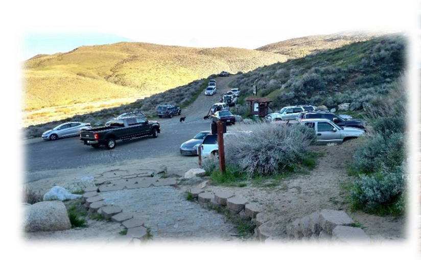
Kings Canyon TH 2017

Throughout construction the Kings Canyon road and the trailhead are closed.