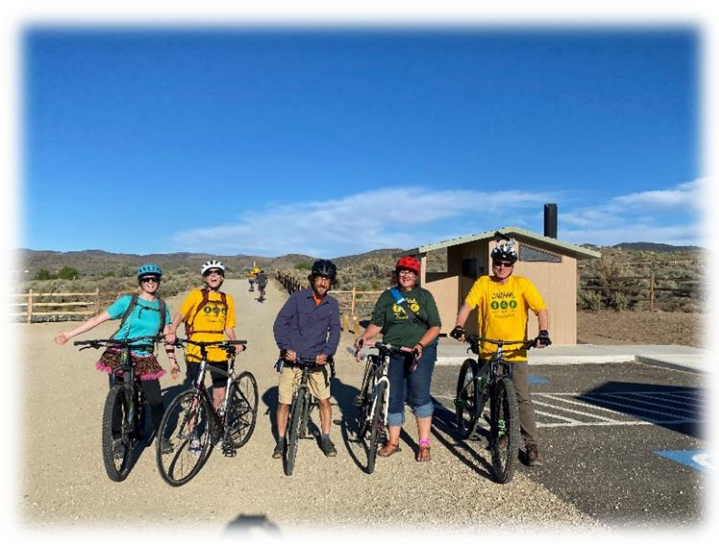
The 5<sup>th</sup> Street Trailhead hosts many events, like a Carson High School Cross-Country race and Muscle Powered "River Cruise" bike ride, both pictured above.