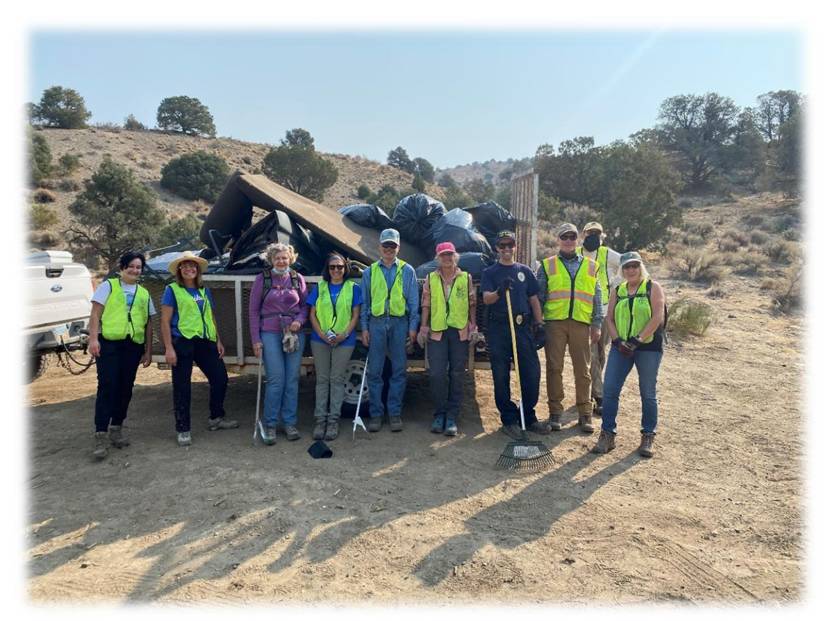
Volunteers stand in front of their second of three trailer loads!

Muscle Powered and the Open Space Division sponsored a clean-up of two washes in East Silver Saddle Ranch on the east side of Sierra Vista Lane. Fifteen volunteers more than filled a 20-yard dumpster with trash.