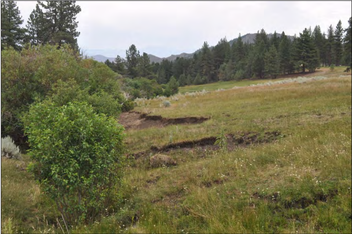
2021 Condition, photo taken October 21, 2021 (view south)