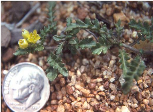
Tahoe Yellow Cress