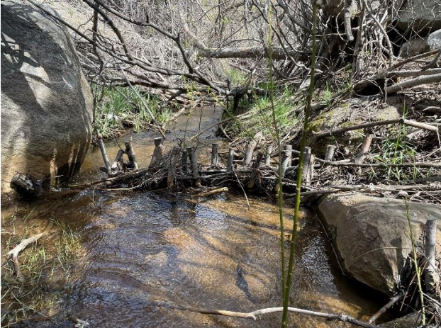
Photo monitoring of analog beaver dams in Rosewood Creek Continuation Area